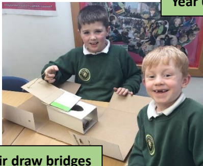
Class 2 with their draw bridges