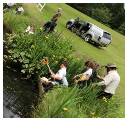
Class 3's visit to Countryside Day