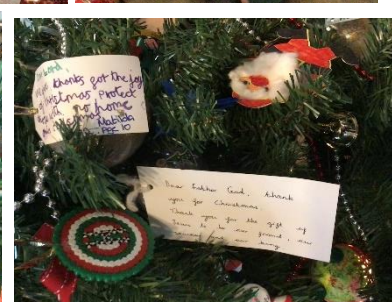
Our Christmas Tree at St Oswald's Church