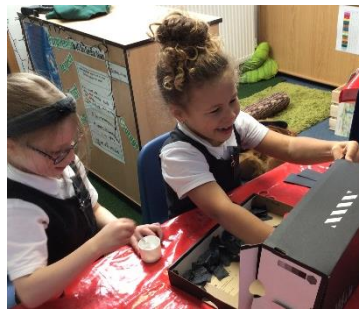
God's creation of the world