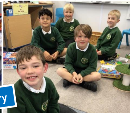
The Kestrels Photo Gallery