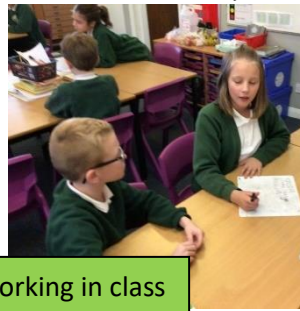
Class 4 working in class