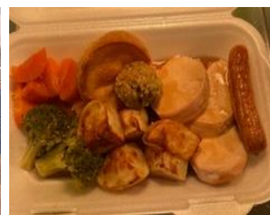
Dining hall – Class 1 then Class 4