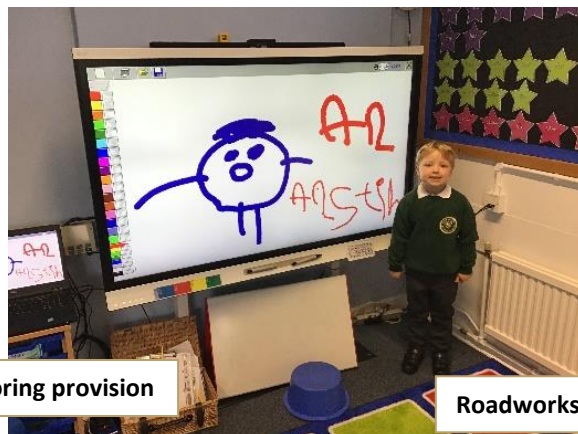
Roadworks finally appear in Hawksworth!