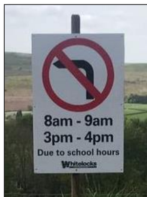
The quarry sign

-- their own (they have branded Whitelocks wagons) and those of third parties -- not to use Main Street during school pick up/drop off. The sign below appears outside the quarry.