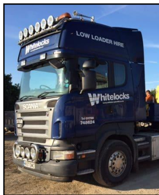
A Whitelocks wagon