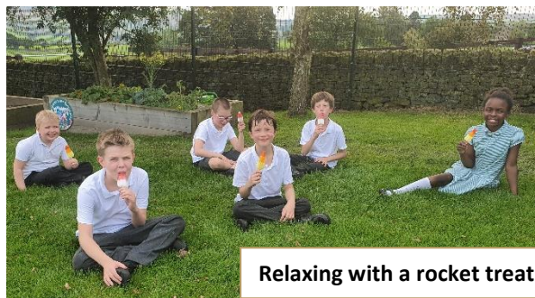
Relaxing with a rocket treat!

It was a hot start to the week, to cool down we had a rocket treat 🚀