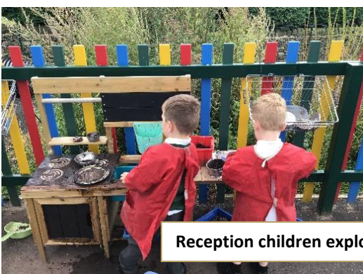
Reception children exploring provision

Year 1 parents - your child's Tapestry account is now inactive. If you have not downloaded the file that was sent via email/to your Tapestry account in July, please let us know and we can arrange sending the file/learning journey via email so you have it to keep.