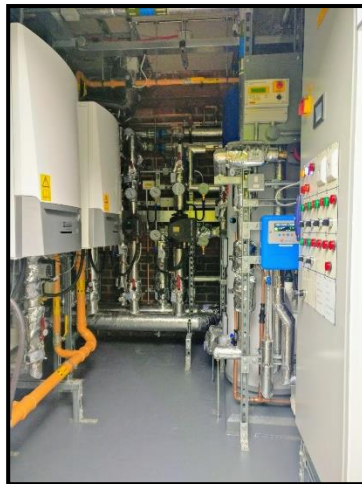
The new boiler room Sept. 2020