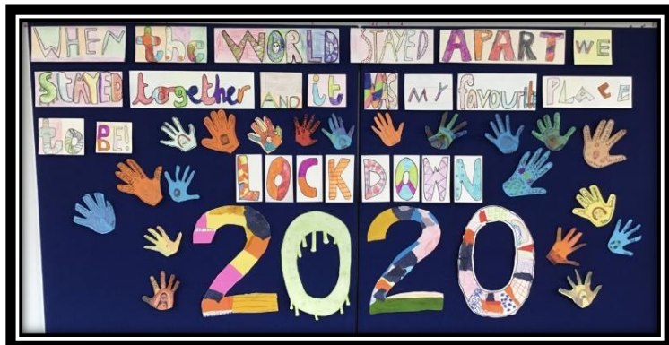
(left) The Key Worker bubble lockdown – a collaborative piece of artwork.