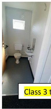
Class 3 toilets