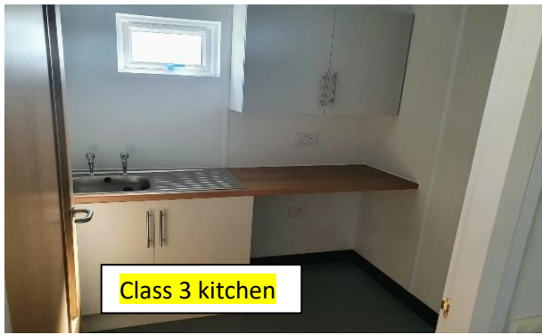
Class 3 kitchen