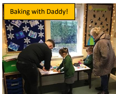
Baking with Daddy!