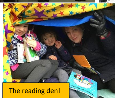
The reading den!