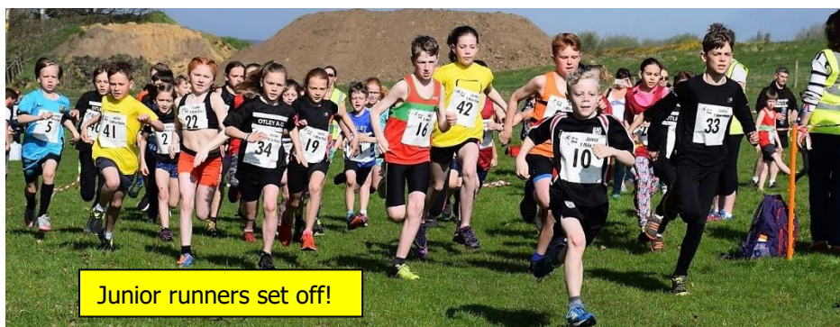
Junior runners set off!