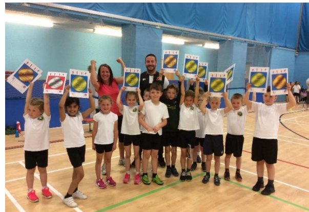
The Hawksworth Skipping Team are Winners!