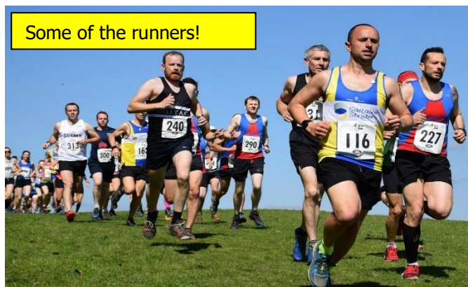
Some of the runners!