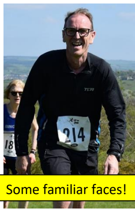
Some familiar faces!