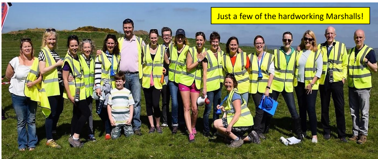
Just a few of the hardworking Marshalls!